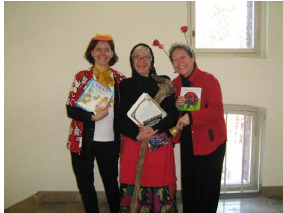
Tacky, Strega Nona and the Grouchy Lady Bug Petterson