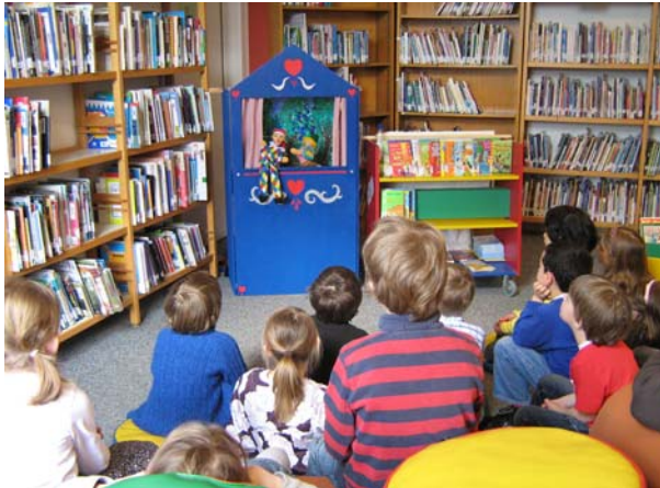
Avid Audience for the Puppet Show