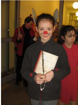
Junie B Jones

As I write this, we've just finished our Book Character Parade. This year we had an exceptionally great turn out of characters. We started the parade with the youngest students and walked all through the school adding each class to the tail of the parade. The Middle School students and staff were especially appreciative of all the creativity and love of literature that was in evidence. I found it a bit daunting to realize how many books kids love that I haven't yet read! A great project for the Spring Break!