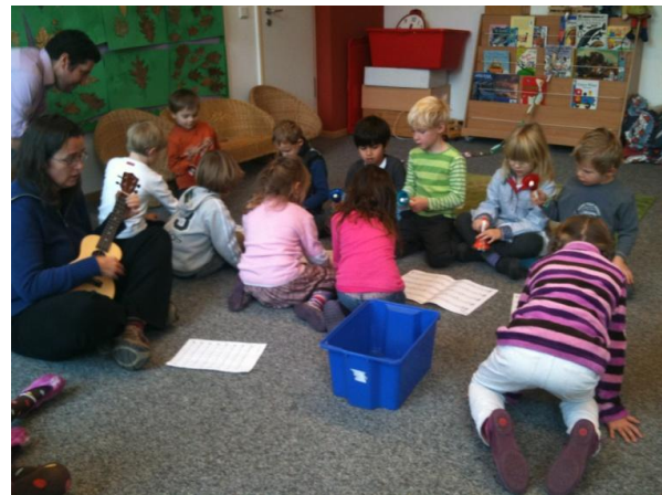
Grade I and EC5 preparing for their concerts

Finally one question asked what role concerts play in a child's education at BBIS. One parent responded very eloquently so I am including their whole response: